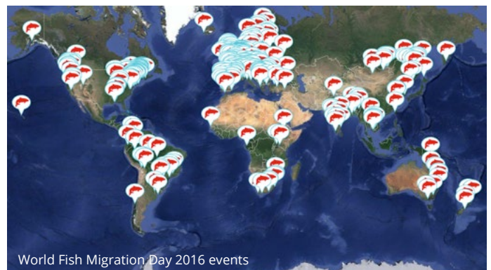
World Fish Migration Day 2016 events

activities: field trips, events at a school or aquaria, the opening of fishways, races, food festivals, etc. At this local level, the logo and central message of the World Fish Migration Day, Connecting fish, rivers and people , will be used to connect sites around the world. The day will start in New Zealand and will follow the sun around the world, ending in Hawaii.