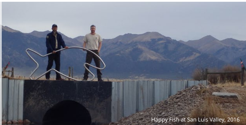
Happy Fish at San Luis Valley, 2016

In 2018, the Happy Fish symbol will also travel to our partner "The Museo Nacional de Historia Natural" in Bolivia!